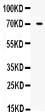
Figure 1. Western blot analysis of Angiopoietin-1 using anti-Angiopoietin-1 antibody (ABO10116). Electrophoresis was performed on a 5-20% SDS-PAGE gel at 70V (Stacking gel) / 90V (Resolving gel) for 2-3 hours. lane 1: recombinant human ANGPT1 protein 1ng After Electrophoresis, proteins were transferred to a Nitrocellulose membrane at 150mA for 50-90 minutes. Blocked the membrane with 5% Non-fat Milk/ TBS for 1.5 hour at RT. The membrane was incubated with rabbit anti-Angiopoietin-1 antigen affinity purified polyclonal antibody (Catalog # ABO10116) at 0.5 \mu g/mL overnight at 4°C, then washed with TBS-0.1%Tween 3 times with 5 minutes each and probed with a goat anti-rabbit IgG-HRP secondary antibody at a dilution of 1:10000 for 1.5 hour at RT. The signal is developed using an Enhanced Chemiluminescent detection (ECL) kit with Tanon 5200 system. A specific band was detected for Angiopoietin-1 at approximately 70KD. The expected band size for Angiopoietin-1 is at 57KD.