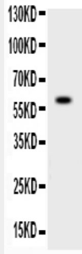
Figure 1. Western blot analysis of ADAMTS4 using anti-ADAMTS4 antibody (ABO10265). Electrophoresis was performed on a 5-20% SDS-PAGE gel at 70V (Stacking gel) / 90V (Resolving gel) for 2-3 hours. Lane 1: Recombinant Human ADAMTS4 Protein 0.5ng After Electrophoresis, proteins were transferred to a Nitrocellulose membrane at 150mA for 50-90 minutes. Blocked the membrane with 5% Non-fat Milk/ TBS for 1.5 hour at RT. The membrane was incubated with rabbit anti-ADAMTS4 antigen affinity purified polyclonal antibody (Catalog # ABO10265) at 0.5 \mu g/mL overnight at 4 ^{\circ} C, then washed with TBS-0.1%Tween 3 times with 5 minutes each and probed with a goat anti-rabbit IgG-HRP secondary antibody at a dilution of 1:10000 for 1.5 hour at RT. The signal is developed using an Enhanced Chemiluminescent detection (ECL) kit with Tanon 5200 system. A specific band was detected for ADAMTS4 at approximately 58KD. The expected band size for ADAMTS4 is at 53KD.