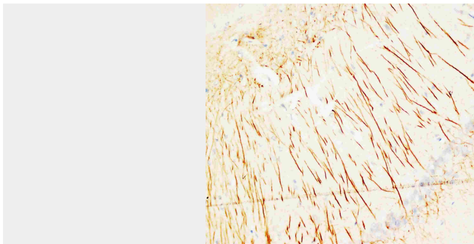
Anti-MAP2 antibody (monoclonal), ABO10446, IHC(P)IHC(P): Rat Brain Tissue