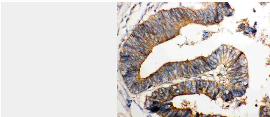
Anti- NMI Picoband antibody, ABO12031, IHC(P) IHC(P): Human Intestinal Tissue