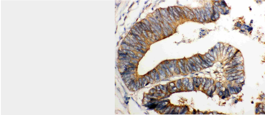
Anti- NMI Picoband antibody, ABO12031, IHC(P) IHC(P): Human Intestinal Tissue