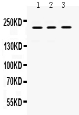
Anti- CD45 Picoband antibody, ABO12471, Western blotting All lanes: Anti CD45 (ABO12471) at 0.5ug/ml Lane 1: JURKAT Whole Cell Lysate at 40ug Lane 2: HL-60 Whole Cell Lysate at 40ug Lane 3: K562 Whole Cell Lysate at 40ug Predicted bind size: 220KD Observed bind size: 220KD