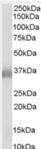
AF1082a (0.1 µg/ml) staining of Human Brain lysate (35 µg protein in RIPA buffer). Primary incubation was 1 hour. Detected by chemiluminescence.