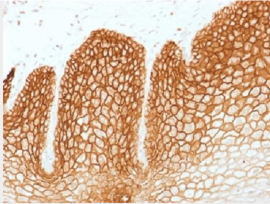
Formalin-paraffin human Cervical Carcinoma stained with CD44v6 Monoclonal Antibody (CD44v6/1246)