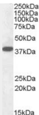
Antibody (0.1 ug/ml) staining of Human Cerebellum lysate (35 ug protein in RIPA buffer).