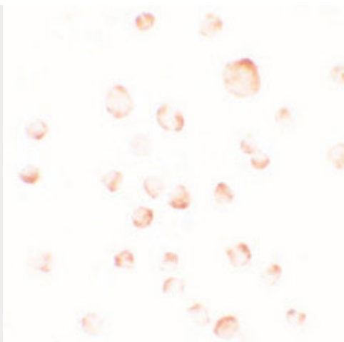
Immunocytochemistry of PHLPP1 in SW480 cells with PHLPP1 antibody at 2.5 ug/ml.