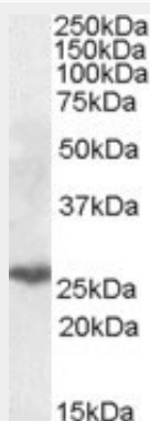
PSMB10 antibody (0.3 ug/ml) staining of Human Lung lysate (35 ug protein/ml in RIPA buffer).