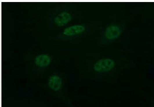
Immunofluorescent staining of HeLa cells using anti-CD163 mouse monoclonal antibody.