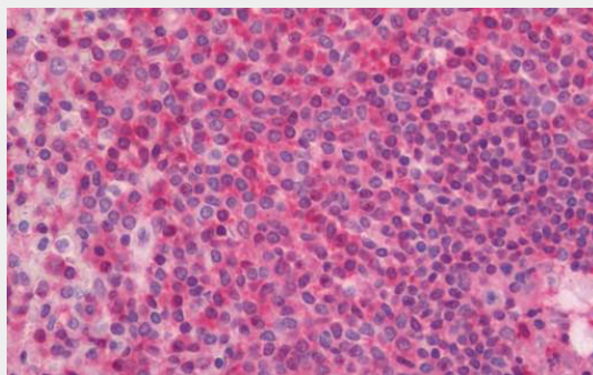
Human Spleen: Formalin-Fixed, Paraffin-Embedded (FFPE)