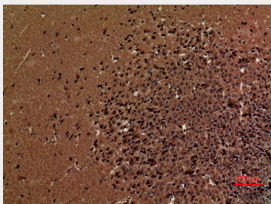
Immunohistochemical analysis of paraffin-embedded mouse-brain, antibody was diluted at 1:100