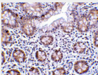
Immunohistochemistry of LSD1 in human small intestine tissue with LSD1 antibody at 2 \mu g/mL.