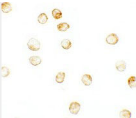
Immunocytochemistry of JMJD3 in K562 cells with JMJD3 antibody at 2.5 µg/mL.