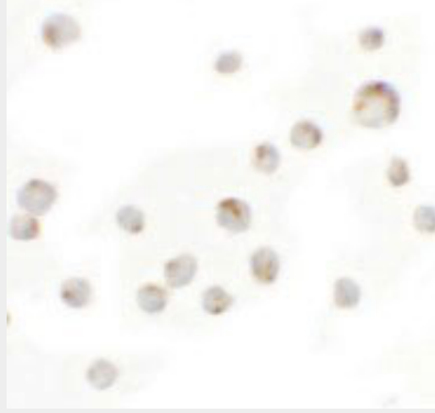
Immunocytochemistry of WDR5 in 293 cells with WDR5 antibody at 5 µg/mL.